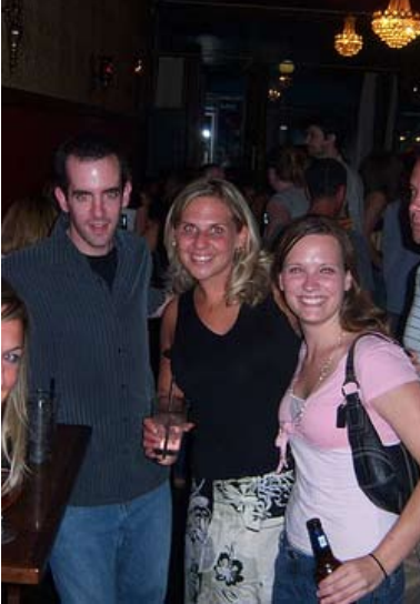
FYI, practices are what we call "happy hours."

Talk to your captain about trading you to another team. Trades are allowed as long as shirts are swapped and everyone is okay with the moves.